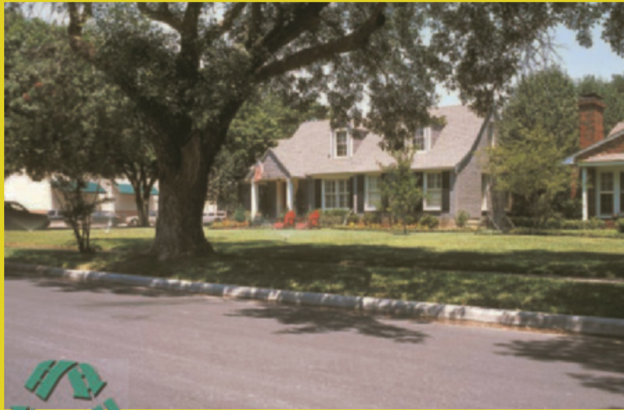
Wentwood Boulevard (above and center)