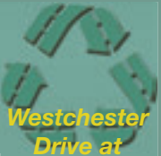
Westchester Drive at Highland Park High School, University Park, TX