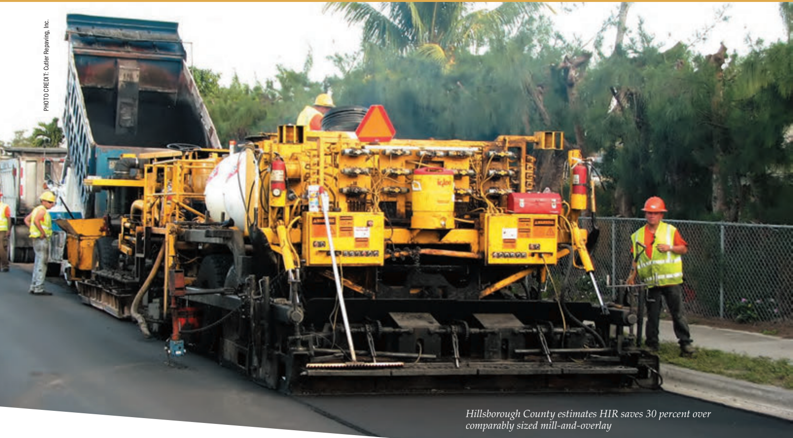
Hillsborough County estimates HIR saves 30 percent over comparably sized mill-and-overlay

surface. We avoid that with hot in-place repaving.”