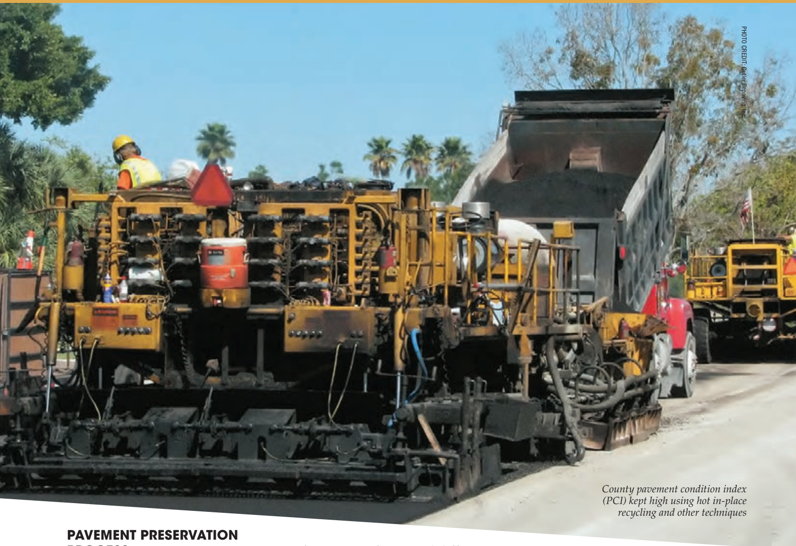
County pavement condition index (PCI) kept high using hot in-place recycling and other techniques